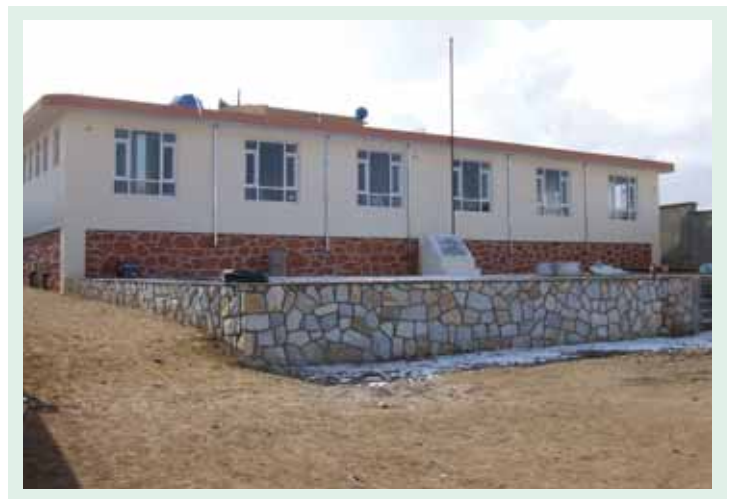
Hazrat Mohammad (SAWW) Orphanage

Our priorities continue to be long term water provision, emergency food and water, providing support for orphans and widows. We are passionate about what we do and base our work on the very core of Islam which emphasises the importance of humanitarian work.